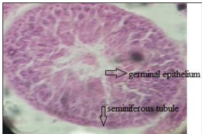
Fig 1: Regular seminiferous tubule with normal germinal epithelium morphology, in control group. (X100).