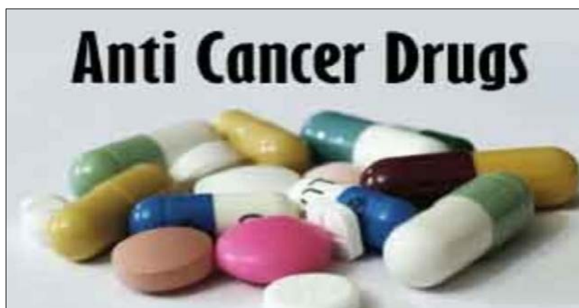
Fig 1: Anticancer drug.