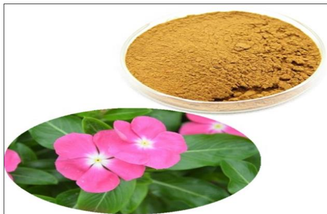
Fig 2: Cultivated product of Vinca.