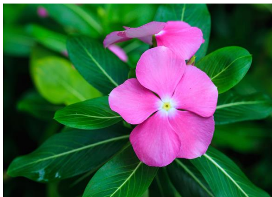
Fig 1: Vinca plant

vinca alkaloids are a material of a class of hydrocarbons which are combined with carbon, hydrogen, nitrogen and oxygen. Vinca alkaloids are earned from Madagascar periwinkle plant. They are surprisingly meterialize or artificial or cellular nitrogenous bases evoke from pink periwinkle plant catharanthus roseus G. Don. Vinca alkaloids are used to cure diabetes, high blood pressure. Vinca alkaloids are cancer fighters [3, 4, 5, 6, 7].