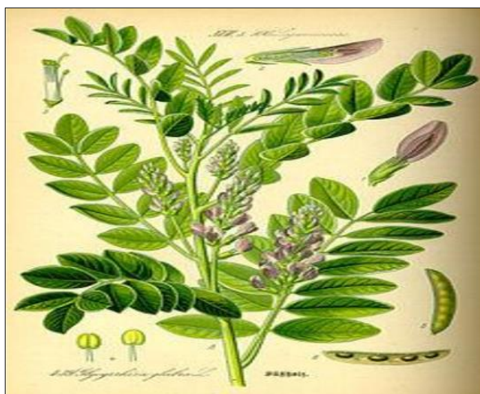
Fig 1: Glycyrrhiza glabra

It is valuable herbal drug [1, 2, 3, 4].