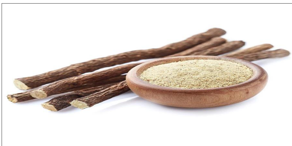
Fig 2: Liquorice

Kingdom: plantae Division: Angiospermae Class: Dicotyledoneae Gens: Leguminosae Family: leguminosae Species: Glabra Linn