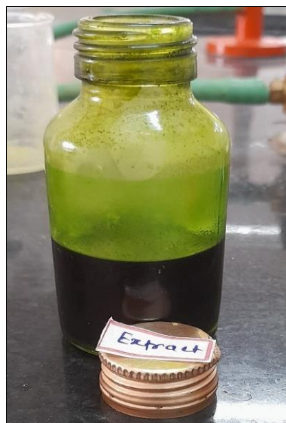
Fig 2: Extract of G. quadriradiata

transfer into the bottom flask again and the final ethanolic extract is collected and evaporate the excess ethanol to get concentrated extract.