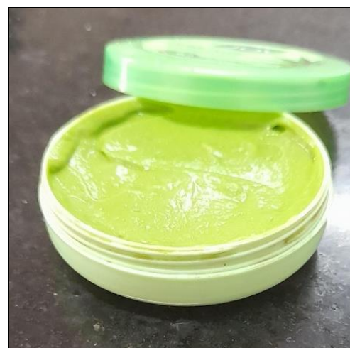
Fig 3: Herbal antiseptic cream