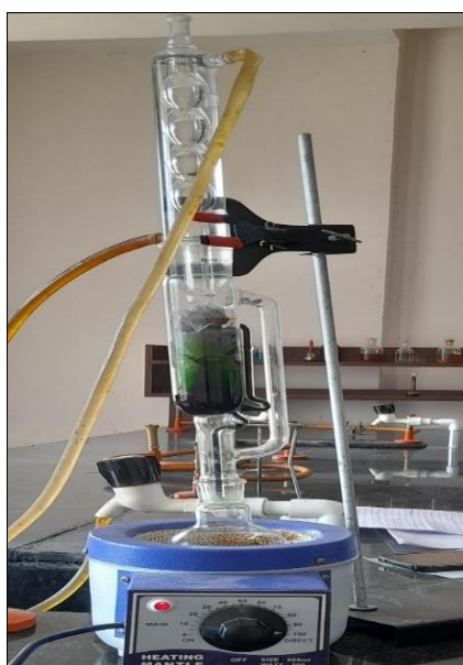
Fig 1: Soxhlet extraction

thimble, condenses in condenser and drip back when the liquid content reaches the siphon arm, the liquid content